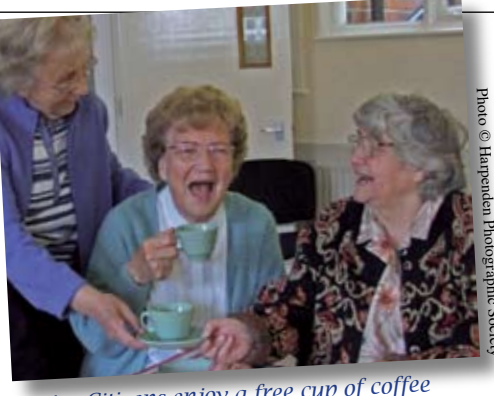
and a biscuit