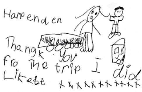
letters given to one the Trust volunteers

In August, 67 children, 30 parents and four volunteers boarded two coaches and a minibus in Harpenden and made their way up the M1 to Twin Lakes Family Theme Park near Melton Mowbray for our annual children's outing. The sun shone and the mini steam train carried us round the park, taking the more adventurous to the "Log Flume" and "Buffalo Stampede" and the less energetic to see the animals in "Red Rooster Farm" or to watch the falconry display. With lots of space to run around in and playgrounds too, many of the children (and parents!) were exhausted when the time came to head home, taking