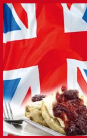
Jubilee Tea Party