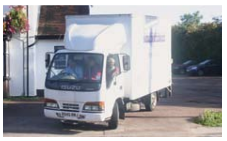
Simon and two of the team head off to deliver to a Harpenden household

furniture or electrical appliances to donate, please contact us. If these goods are of use to us we will arrange to have them collected. Electric goods require a PAT (portable appliance test), and certain items of furniture such as sofas, armchairs and mattresses must have an approved fire certificate.